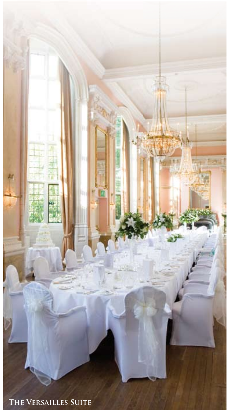
THE VERSAILLES SUITE